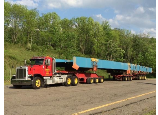
3+3+4 Jeep-Air Axle-Steerable Dolly - 100-Ton Capacity

Previous page, L-R: Stretch trailer en route to the Governor Mario M. Cuomo (Tappan Zee) Bridge project in Westchester-Rockland Counties, N.Y.; a tank is loaded on a double-drop trailer; 16-axle two-bolster steerable dolly heading for the Kosciuszko Bridge project in New York City.